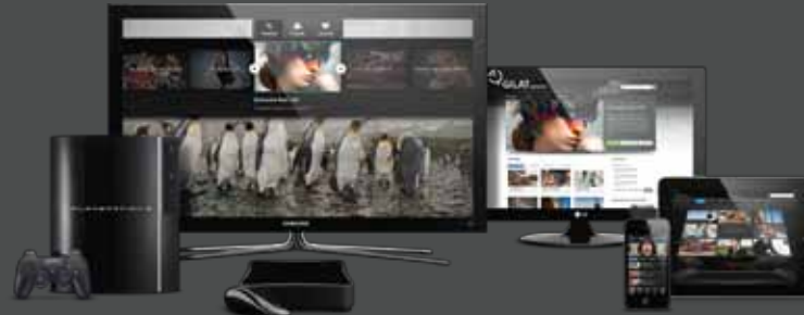
Multi Screens - On any device

Gilat Satcom OTT is a complete solution for Telcos and ISPs looking to expand into the OTT business. Gilat Satcom OTT provides the middleware platform, unique Content Delivery Network (CDN) and tailor-made content packages, including VOD and live channels, to assure the smooth and easy launch of OTT worldwide.